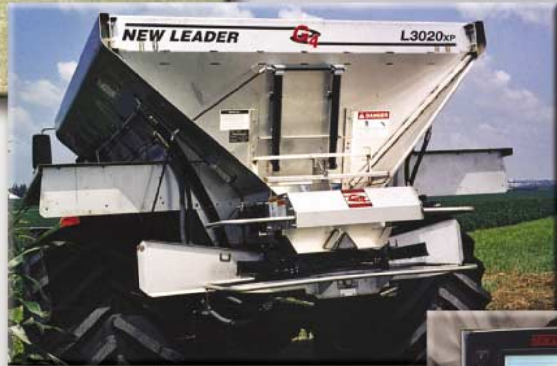
SP.6 DGPS-Ready Control